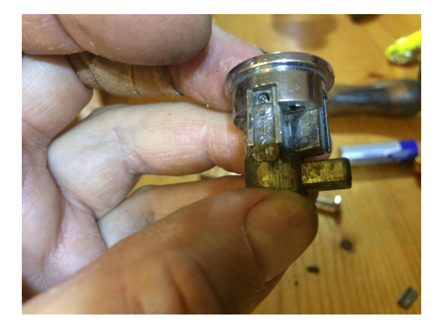
Step 2: The pins that need to be adjusted are behind these plates....

Use a sharp punch to tap them forward far enough to get a grip with pliers then keep your thumb over it so the tiny springs don't fly as you ease the plate out: