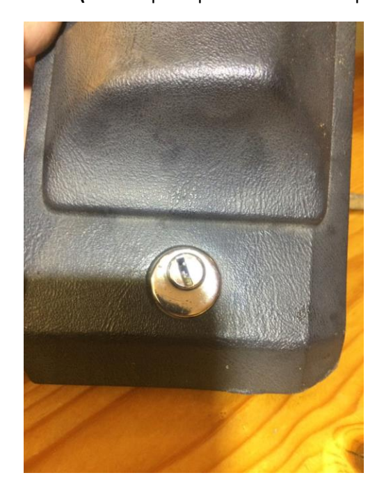
Step 1: Remove the lock retaining ring.....

(But the principle is the same for pannier locks albeit that those barrels use flat tangs instead of round pins.)